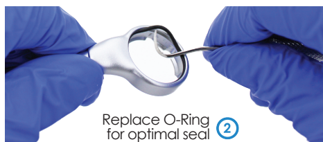
Replace O-Ring for optimal seal ②

4. Replace with a new mirror, beveled side facing down .