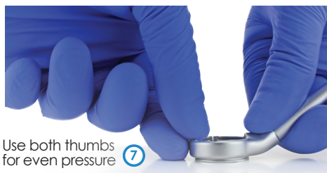
Use both thumbs for even pressure ⑦

7. While applying even pressure with two thumbs, push the mirror head down over the backplate until it pops securely into place.